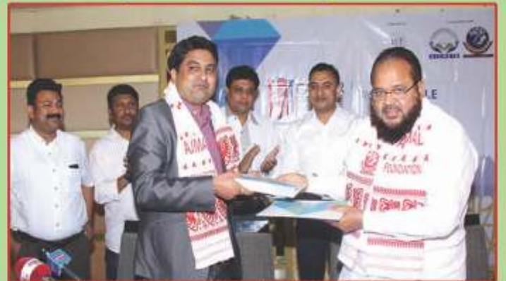
Mr. Sirajuddin Ajmal, MP signing MoU with Institutional Excellence Forum, Noida